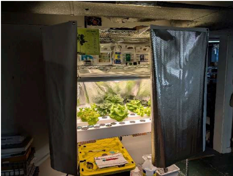
My Hydroponic System

I will not go into detail on the construction and operation because that information is available on-line at the Simply Greens website and many others. I would like to present some photographs of my setup.