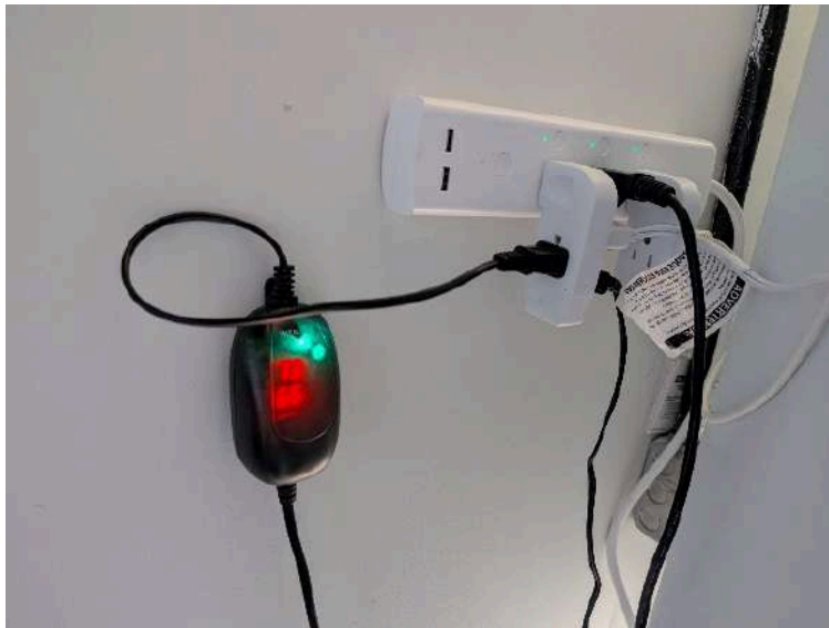
Heater to keep temperature at nominal level