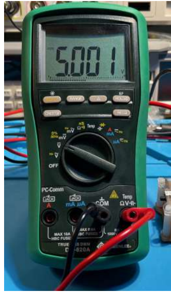
Greenlee DM-820A 10,000 Count, $130