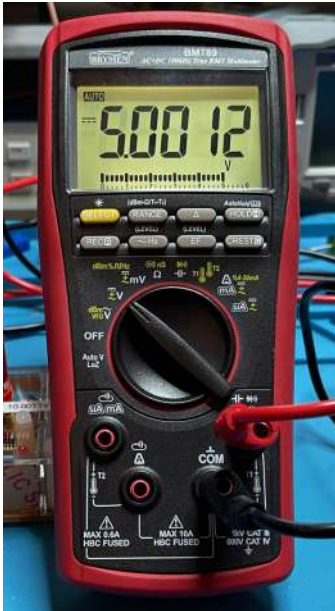
Brymen BM789 60,000 Count, $120