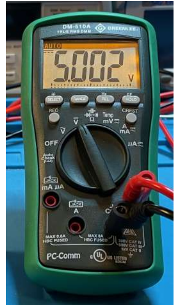
Greenlee DM-510A 6,000 Count, $100