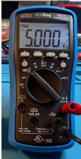
EEVBlog BM-235 6,000 Count, $100