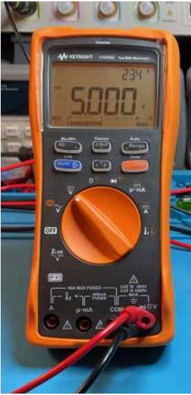
Keysight U1242C 10,000 Count, $310