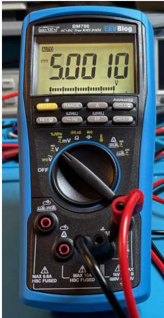
EEVBlog BM786 60,000 Count, $110