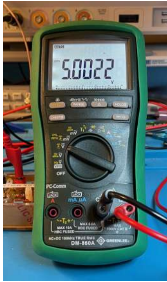
Greenlee DM-860A 50,000 Count, $230