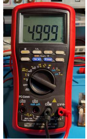
Brymen BM525s 10,000 Count, $120