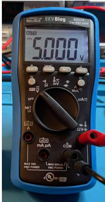
EEVBlog BM-235 6,000 Count, $100