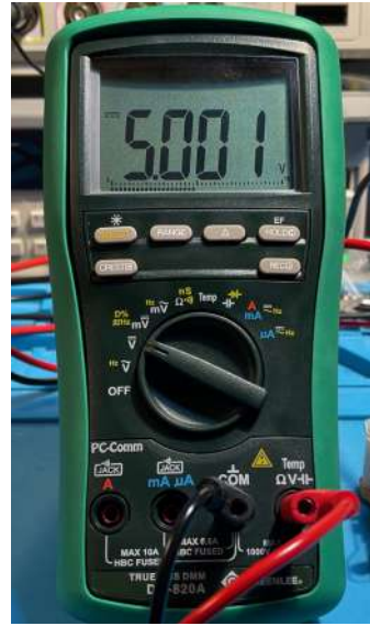
Greenlee DM-820A 10,000 Count, $130