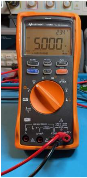
Keysight U1242C 10,000 Count, $310