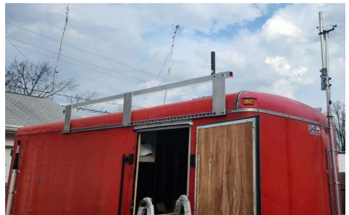
ARES Vehicle with the COMPACTenna 2Meters/440+ antenna en situ