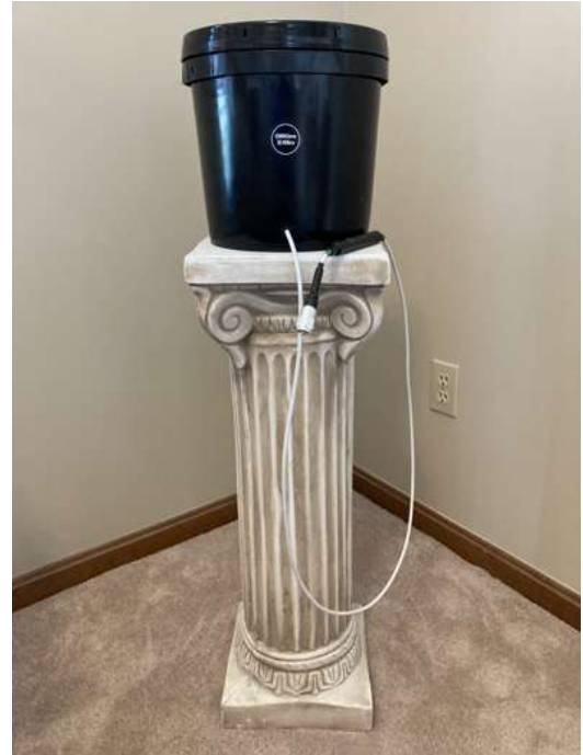
20/40Micro. a tiny antenna for the 20 & 40 Meter HF Bands